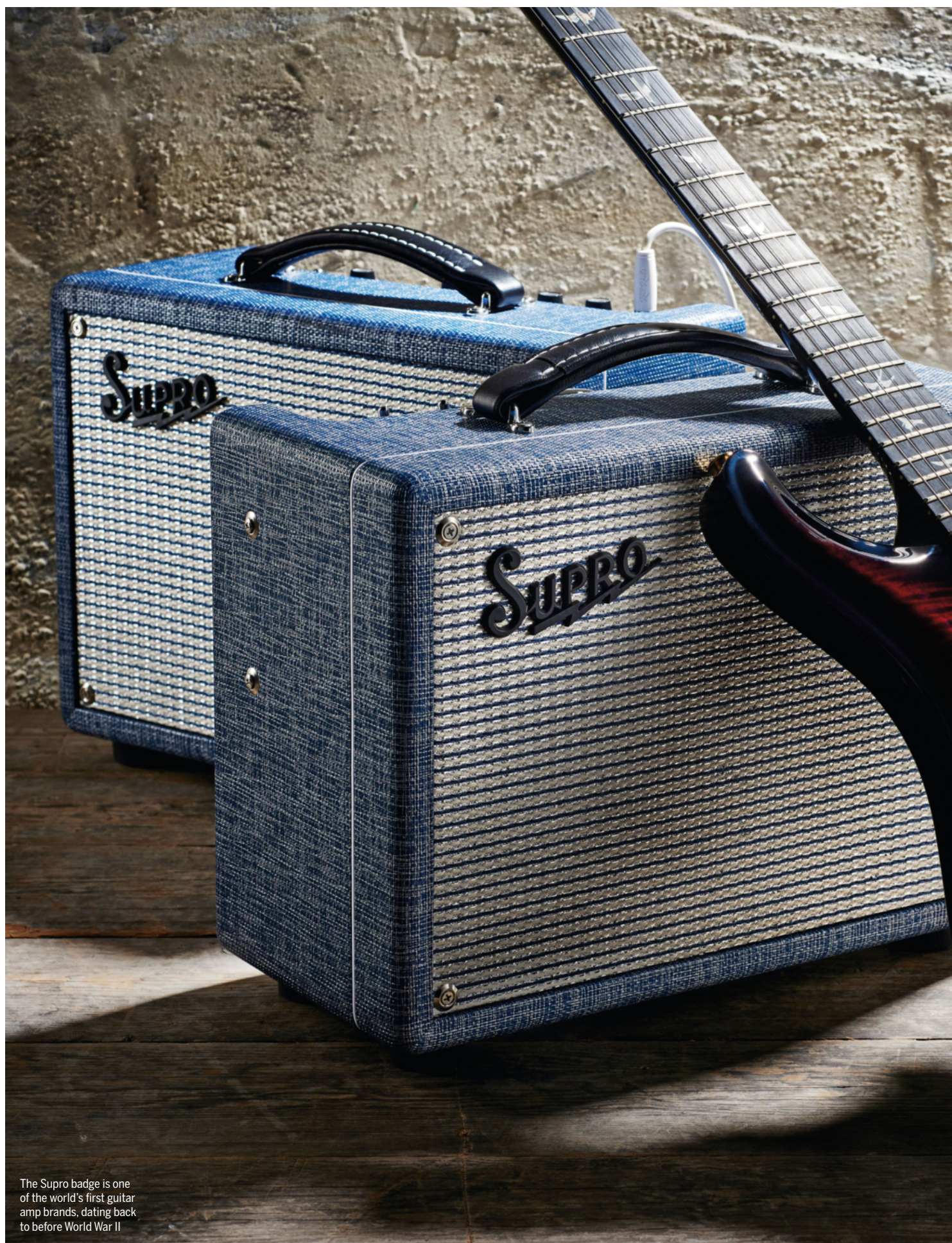
The Supro badge is one of the world's first guitar amp brands, dating back to before World War II