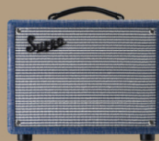
SUPRO 1606 SUPER COMBO £699

..... WHAT IS IT? All valve 1 x 8 reissue combo with five watts RMS output from the 6V6 output stage