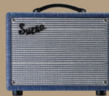
SUPRO REVERB 1605R COMBO £999

..... WHAT IS IT? All valve 1 x 8 reissue combo with five watts RMS output from the 6V6 output stage